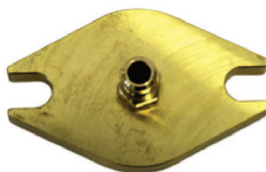
BG EF528 EGR flange 2.31" bolt center exhaust adaptor PN E101-1654