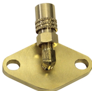
BG EF527 EGR flange 2.31" bolt center intake adaptor PN E101-1692