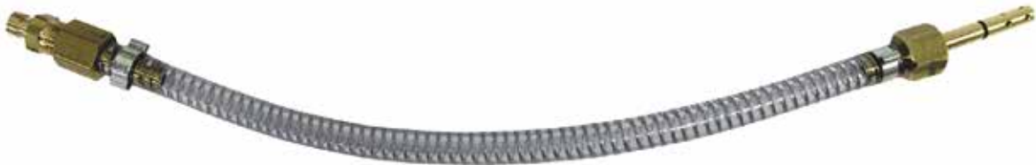
BG EF388 EGR Mercedes Sprinter adaptor PN E101-1653