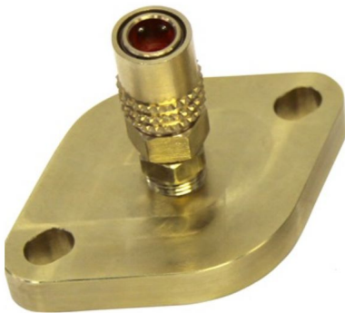
BG EF676 EGR intake adaptor, PN E101-1680