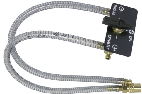
BG EF399 EGR manifold, PN E101-1645