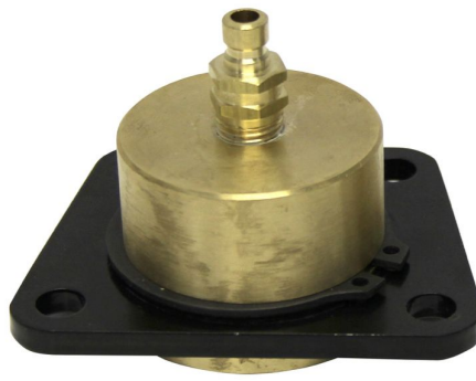
BG EF677 EGR exhaust adaptor, PN E101-1681